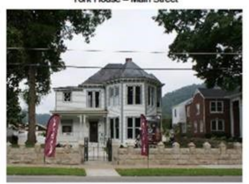
York House - Main Street